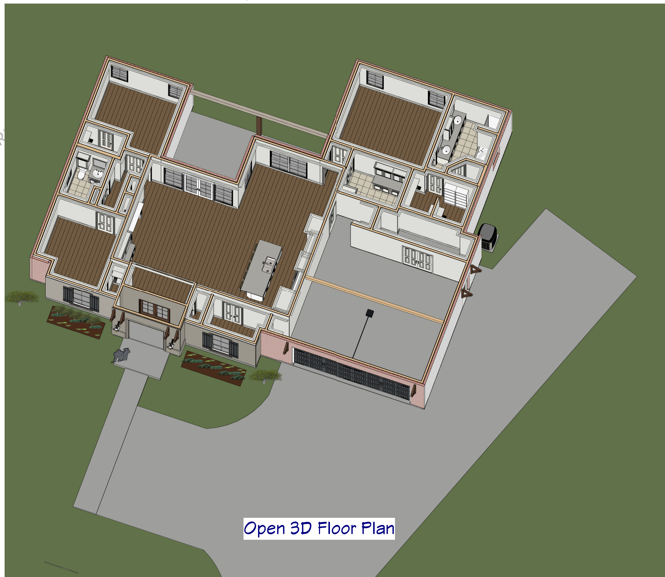
Open 3D Floor Plan