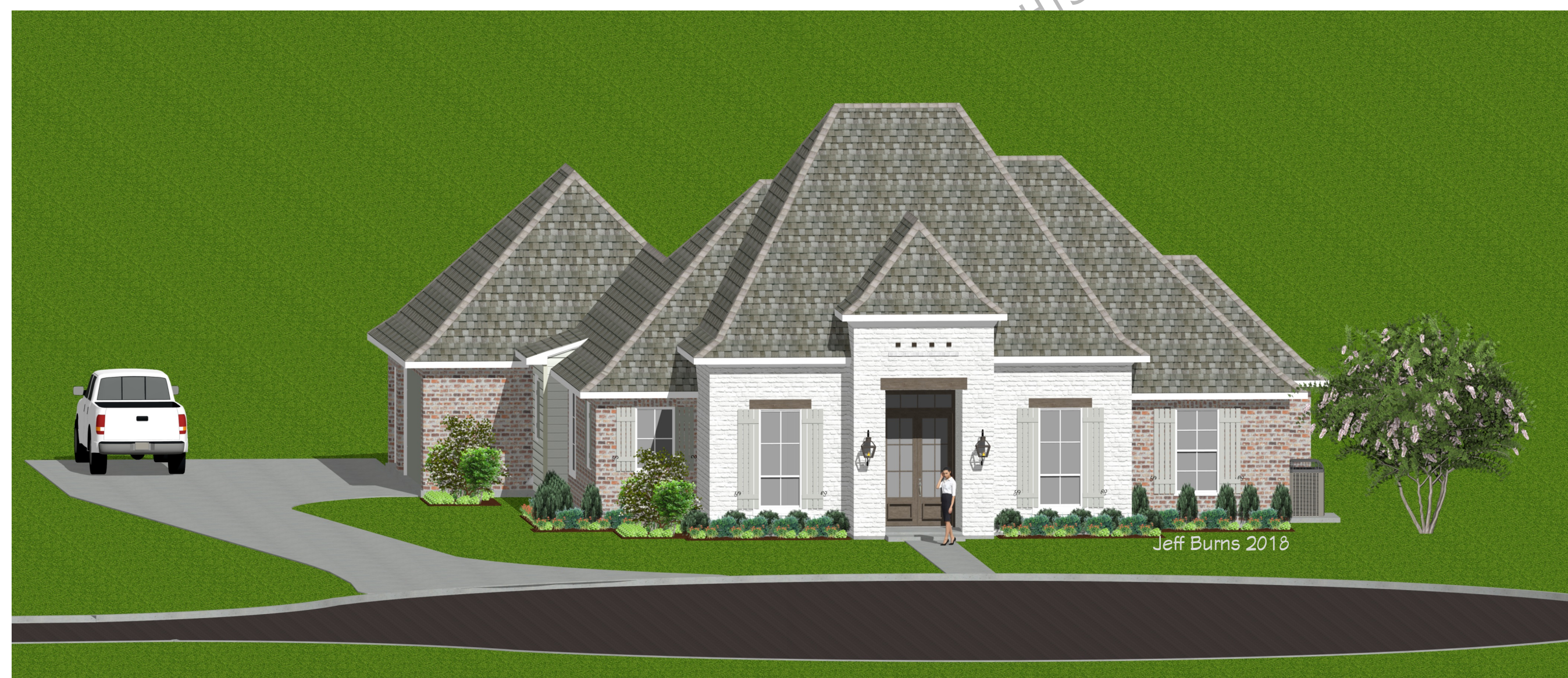
FRONT 3D VIEW